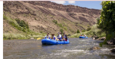
Rafting & Kayaking