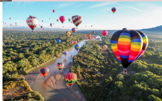
Hot Air Ballooning